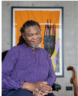
Yinka Shonibare CBE RA Founder and Chair

The G.A.S. team are on site Monday to Friday to support the needs of residents and help with booking trips and visits, organising meetings, accessing the library and delivering events and activations.